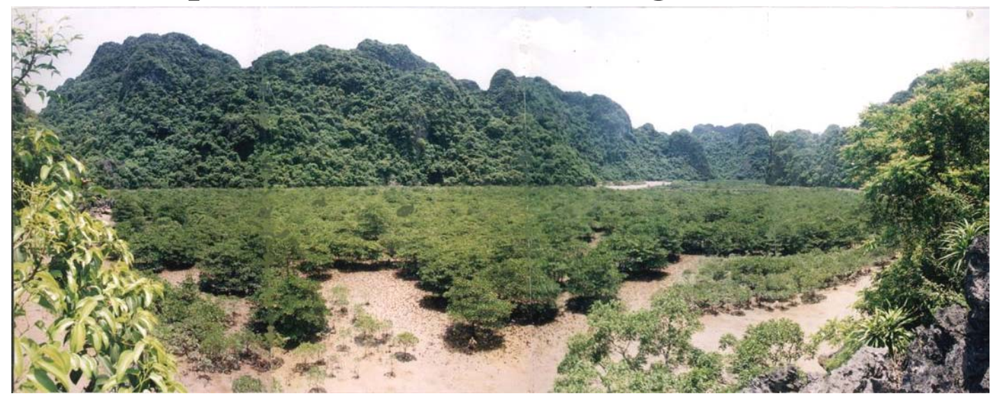
The Ang Valley viewed from its northern edge

Ang valley lies in the limestone mountain area of Tra Ngo Lon island. The valley consists of two parts: the largest part is rectangular shaped and is 1300m long running East-West, 250-300m wide running North-South, while the small part is approximately 1000m<sup>2</sup> wide and is adjoined to the large part at the north-eastern peak.