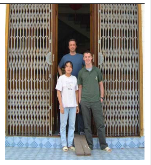
Project staff, outside Frontier's Van Don Office

To provide a base for project activities as well as venue for future Park programmes, the project hopes to build a Nature Centre in one of Bai Tu Long's buffer zone communes. The centre will be used for community meetings and local school activities as well as holding a series of displays explaining various aspects of the National Park.