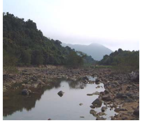
A view from base camp, Tra Ngo island

Overall, this project has exceeded my expectations being in such a beautiful and interesting environment, and with a group that is so dedicated to working for the environment in a realistic way. It has certainly been worth all the effort to get here.