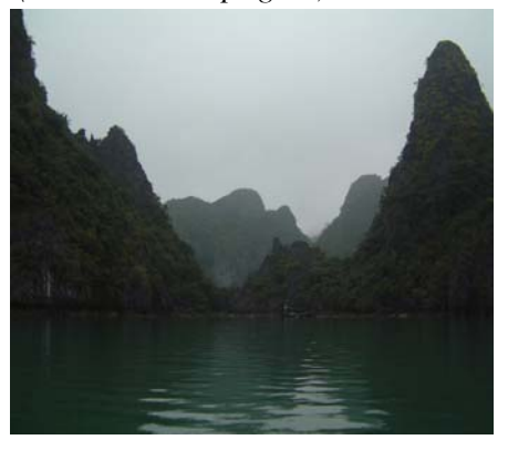
One of many spectacular views of Bai Tu Long Bay