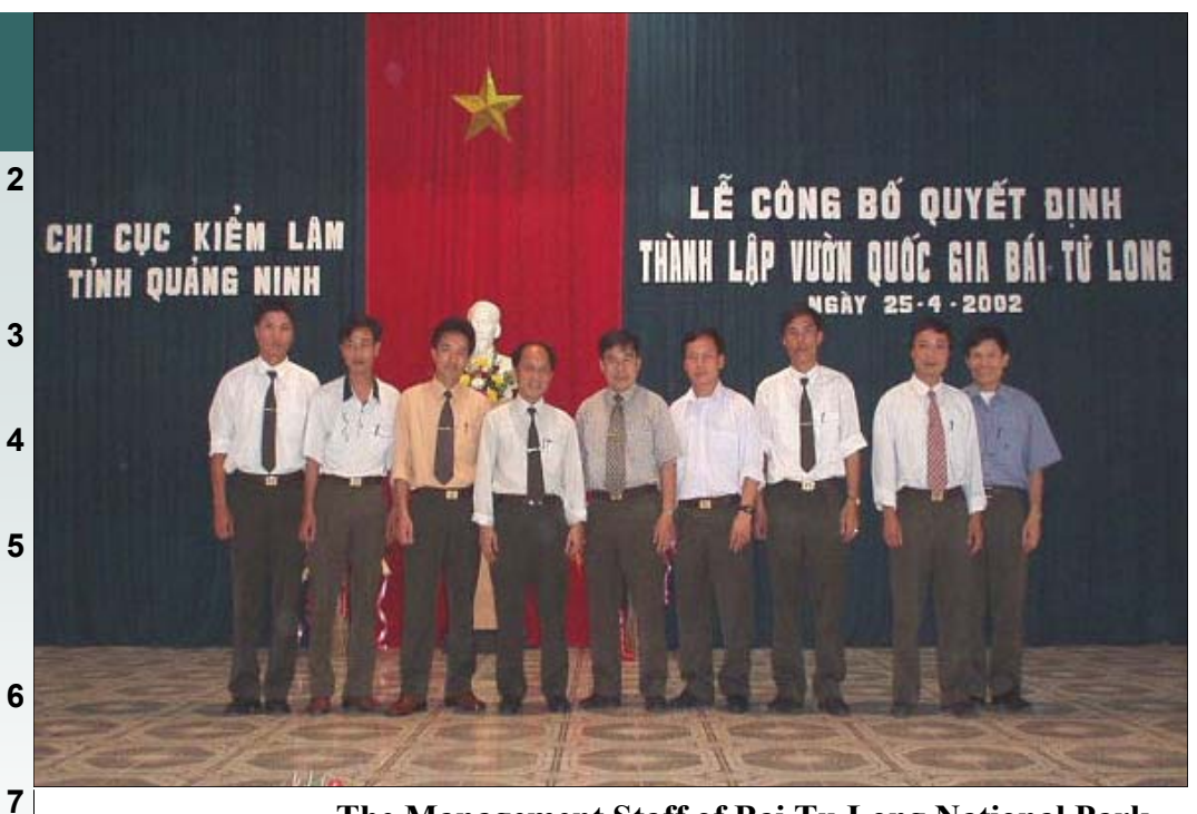
The Management Staff of Bai Tu Long National Park

The aim of this newsletter is to enable the National Park Authority to provide regular information to the people of Bai Tu Long Bay.